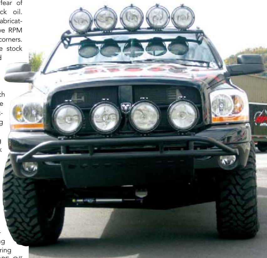
Each of the RPM Offroad race trucks is equipped with nine Baja Design Soltek 8-inch HID lights to cut through the Baja darkness.

Custom Weld Racing 17x9-inch beadlock wheels are wrapped in 37x13.50R17 Toyo Open Country M/T tires, and each truck carried two spares on custom mounts integrated into the rollcage, in the rear of the trucks above the 44-gallon Fuel Safe racing fuel cell. To help steering control at speed, a KORE Off Road Fox steering stabilizer is used on each truck. RPM Offroad