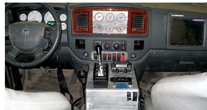
The interior of these trucks is all business, with Auto Meter gauges replacing the stereo and a Lowrance 10.5-inch GPS monitor dominating the dash. They also feature a custom center console for the Art Carr shifter and radio/intercom equipment.