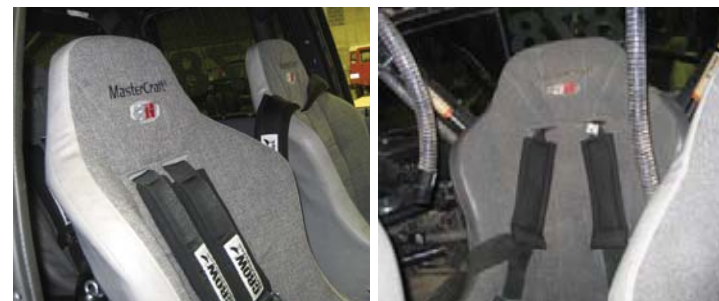
Comfort for three is built into each truck thanks to the MasterCraft 3G suspension seats and Crow five-point racing harnesses.