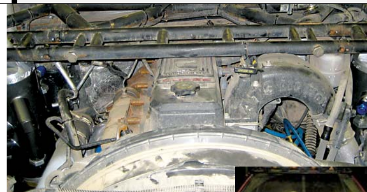
Under that great-looking hood is a powerful Dodge/Cummins turbo diesel engine enhanced with an AEM filter, ATS Diesel manifolds, FASS fuel pump and River City Turbo turbocharger.